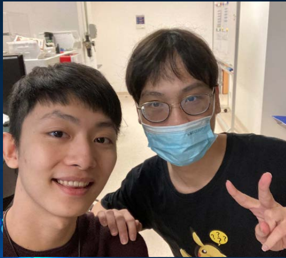
↑ Taken as part of cross-cultural assignment for BU5641