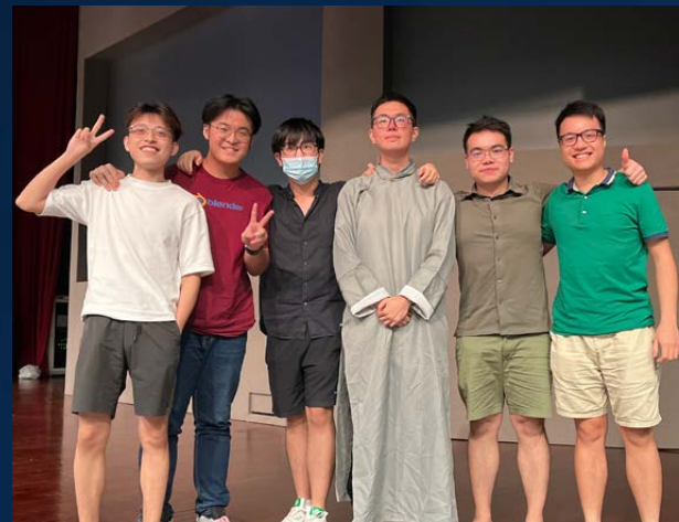
↑ Crosstalk concert