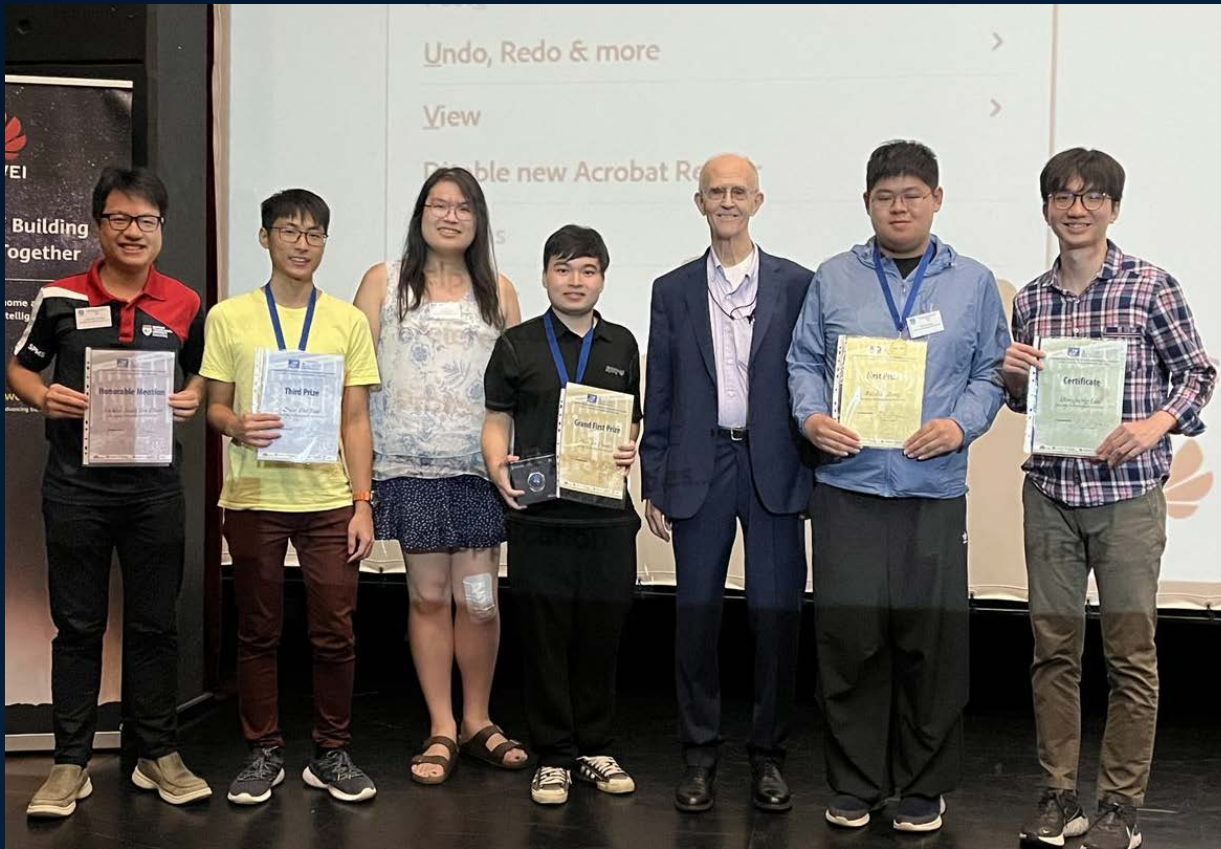
↑ International Mathematical Competition in Bulgaria