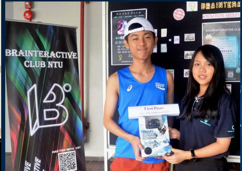
↑ NTU Brainteractive